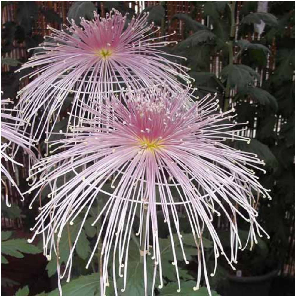
菊 - 管物 (chrysanthemum)