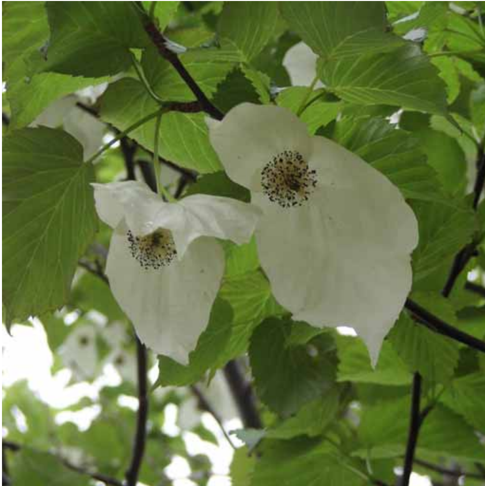
ハンカチーフの木 (handkerchief tree)