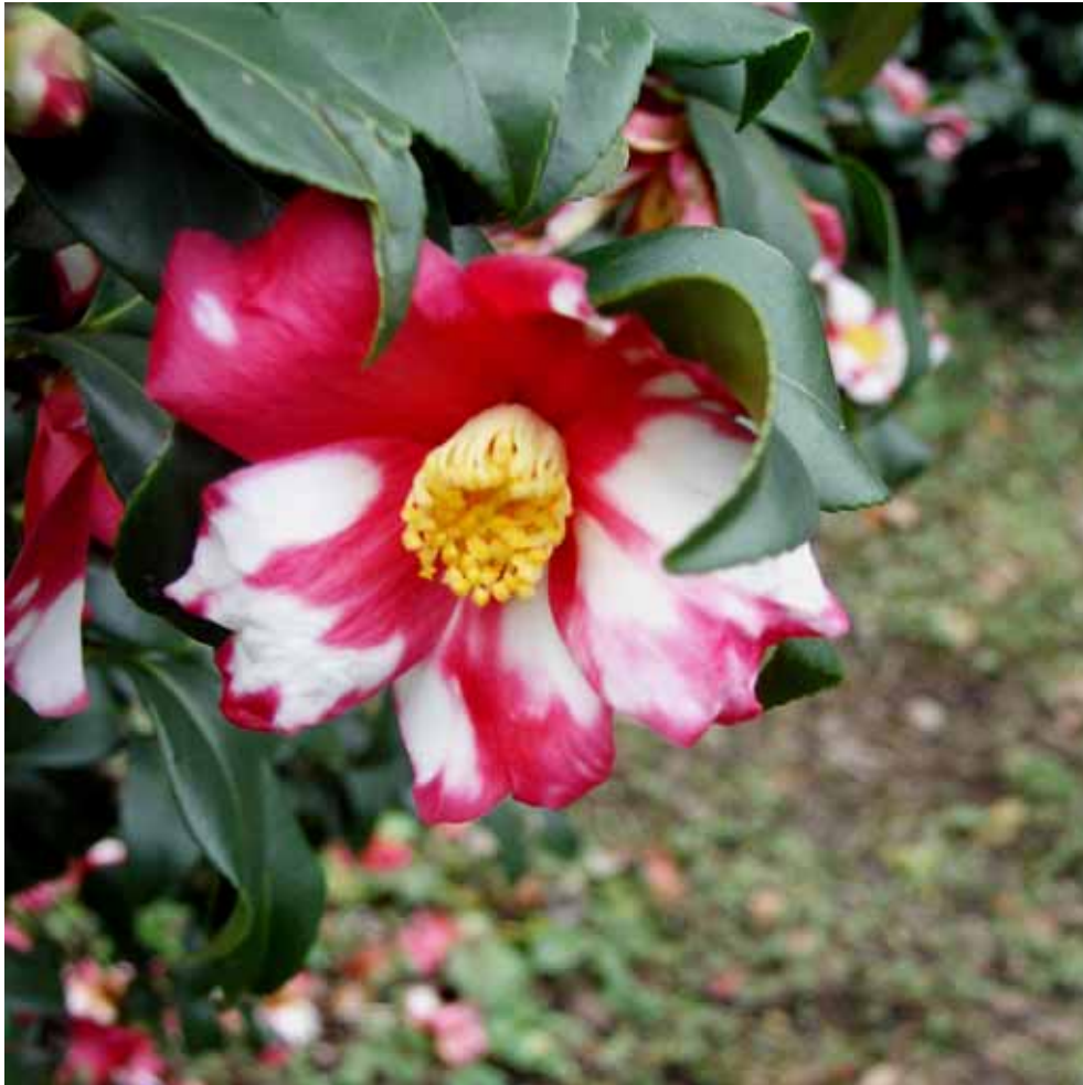
山茶花(camellia sasanqua)