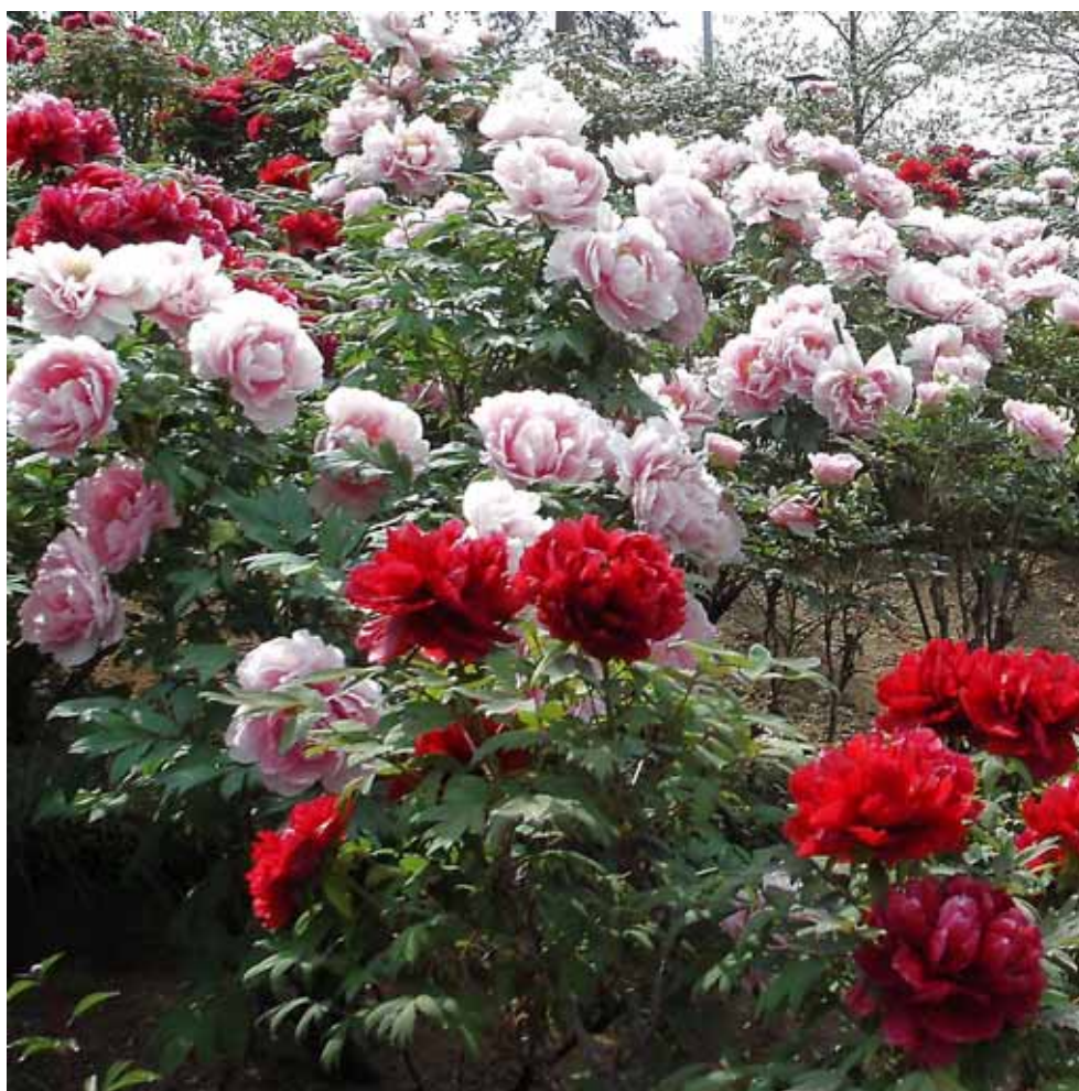
牡丹 (tree peony)