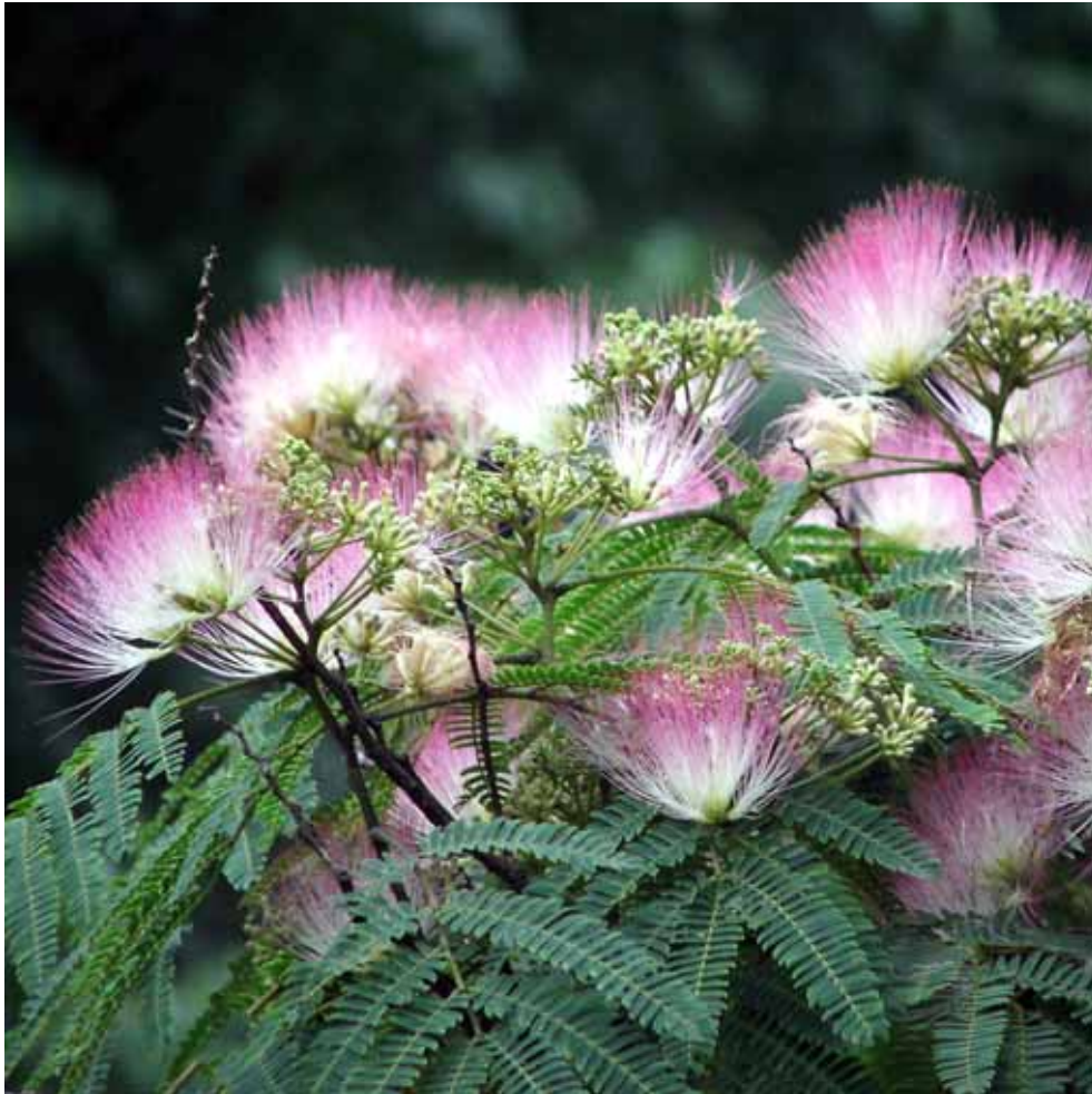
合歡の木 (silk tree)