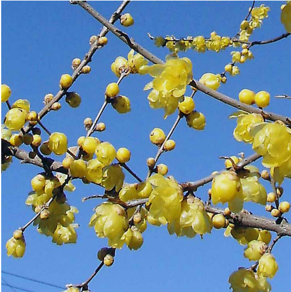
蜡梅 (wintersweet)