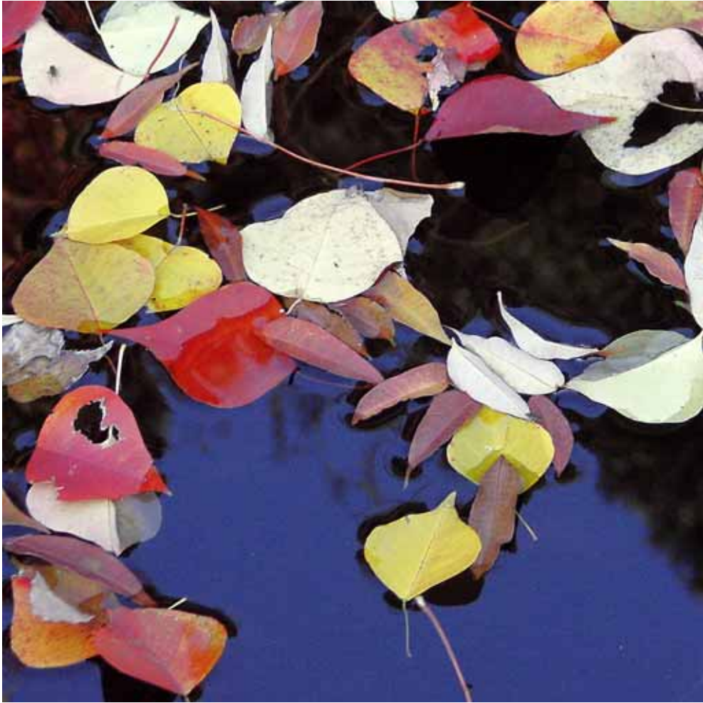
南京黄櫨の落ち葉(Chinese tallow tree leaves)