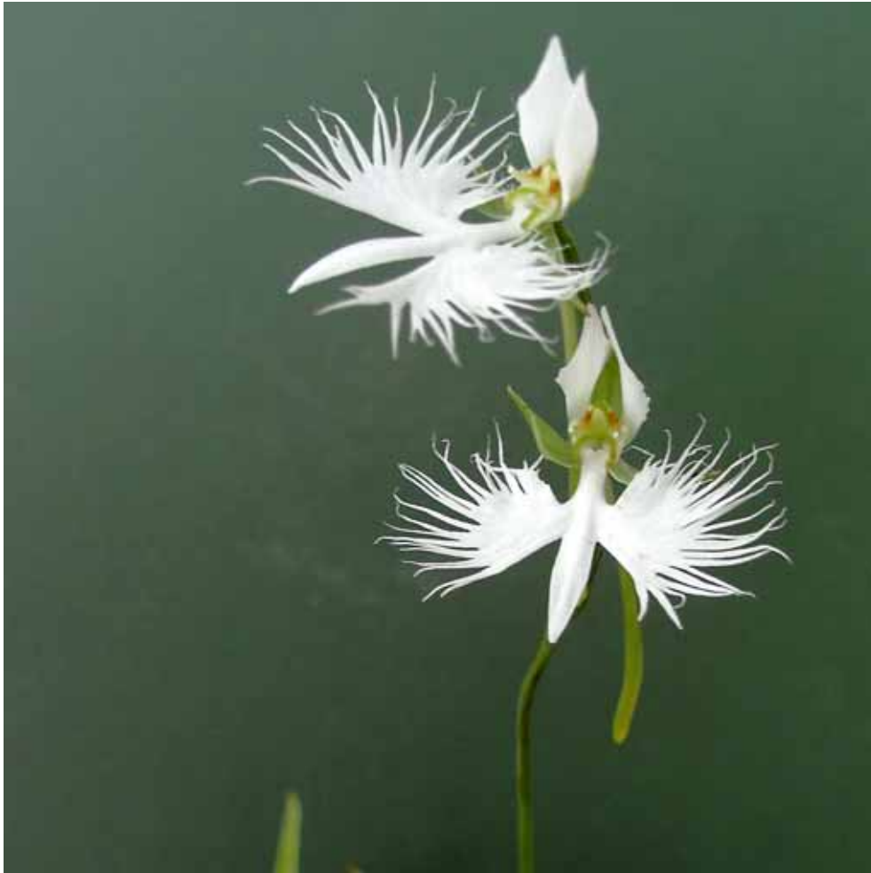
鷺草 (egret flower)