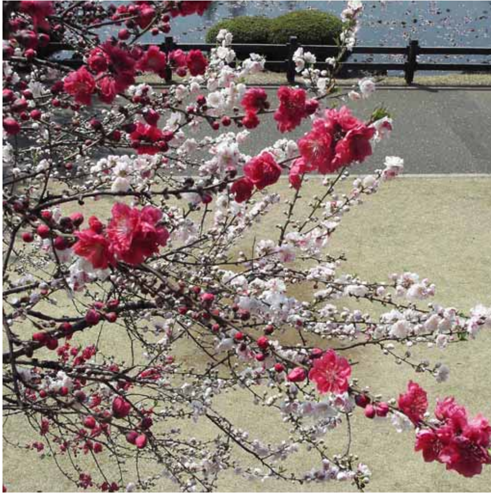
花桃 (snow goose cherry)