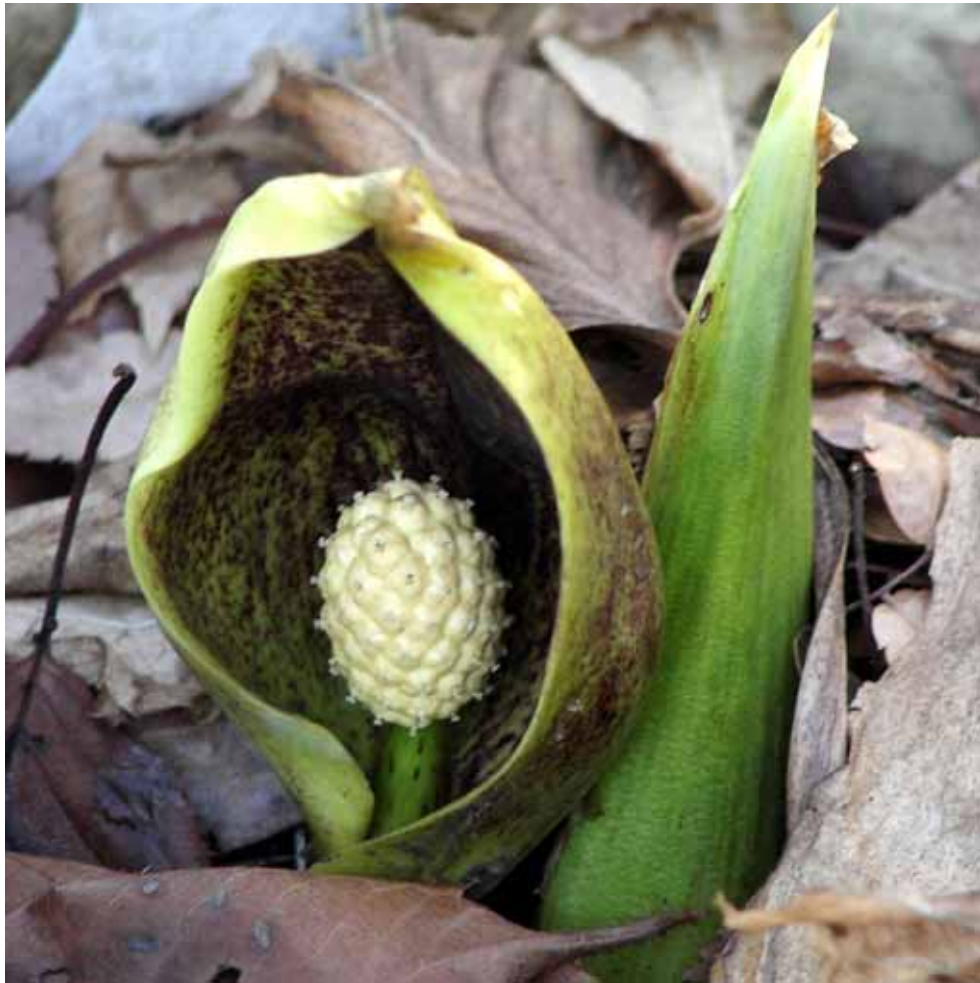
座禅草 (skunk cabbage)