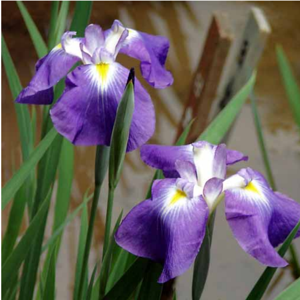
花菖蒲 (Japanese iris)