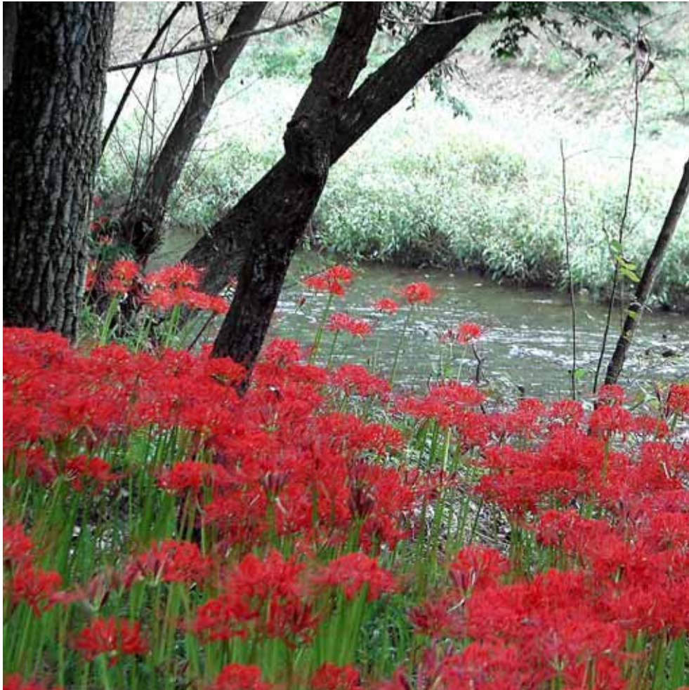
彼岸花 (hurricane lily)